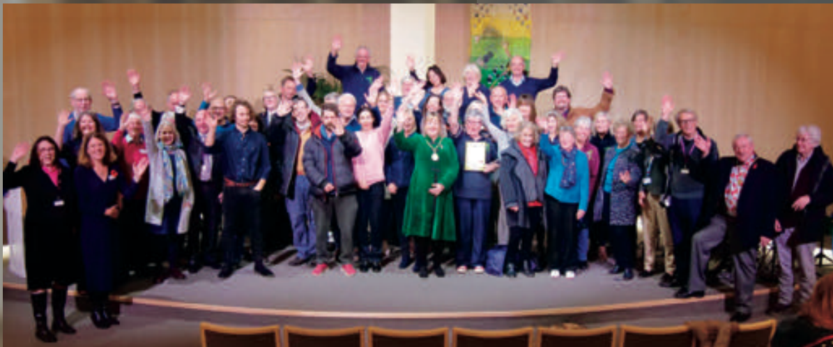
The Annual Commissioning Service held at Millmead Baptist Church celebrating with the Deputy Lieutenant of Surrey, the Mayor of Guildford, Surrey Police, Trustees, Staff, Volunteers, and family and friends...

My highlight of the year was to be able to hold a well-attended Commissioning Service at the kind invitation of Millmead Baptist church with the Mayor and other invited partners. After a two-year gap it was very special to gather as the GTCC family, to welcome new members to the Charity and to bless our many volunteers in public.